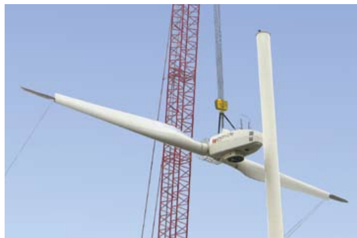
Installing nacelle and blades in one pick.

Advanced Weather Station With superior instrumentation